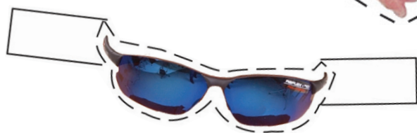
▲ Native Dash XP. $115 at REI.

I've crawled through the woods all over the state testing the latest garb and gear. Here's my head-to-toe take on what to try.