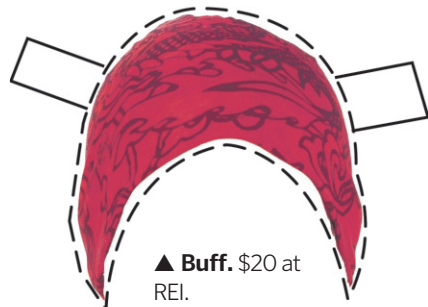
▲ Buff. $20 at REI.

Tempted to reach for a hat or a headband while puffing up the trail? Reach for a Buff instead. This year-round, UV-screening, moisture-wicking, wind-stopping accessory has to be seen to be believed. Click the video on www.buffusa.com for how to use it.